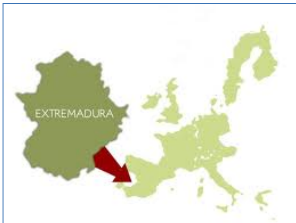
Figure 1: Autonomous Community of Extremadura in Spain

The geographical context for this study is the Province of Cáceres, in the Autonomous Community of Extremadura, a region in the mid-west of Spain, bordering on Portugal.